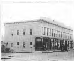
BANK OF BUFFALO CENTER Built in 1893. Burned 1898.